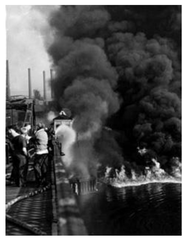
Cuyahoga River Fire Nov. 3, 1952